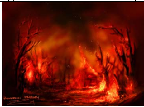
Pict 3 - The Bush on Fire