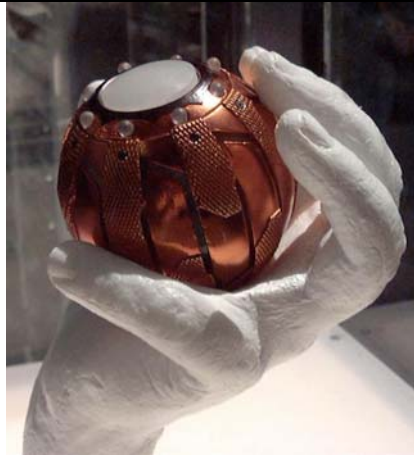
Pict 1 - Unfold Nanobat - Approximate size